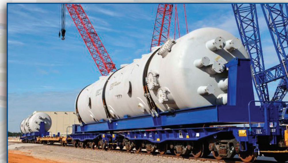
Moisture separator reheaters (MSRs) delivery to Vogtle Unit 3 in Georgia, USA

The above photographs of AP1000 plant and equipment illustrate a portion of Toshiba's planned Czech Republic scope for the potential construction of AP1000 units at the Temelín site.