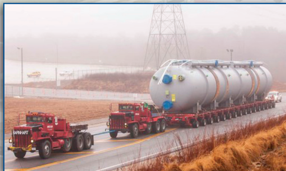
Deaerator delivery to Vogtle Unit 3 in Georgia, USA